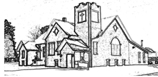
Mt. Pleasant United Methodist Church