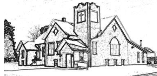
Mt. Pleasant United Methodist Church